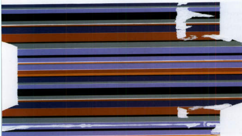
Dazzling: one of Ronald de Bloeme's canvases

All about the influence that consumer goods and advertising have on the world of art, each canvas is bigger, bolder and more dazzling than the one beside it. According to art critic and curator, Christoph Tannert, de Bloeme's works reflect and reduce onto canvas the constant presence of packaging, national symbols, video games and pictograms. As de Bloeme's canvases now travel around the globe, be sure to catch a glimpse of this rather unusual exhibition.